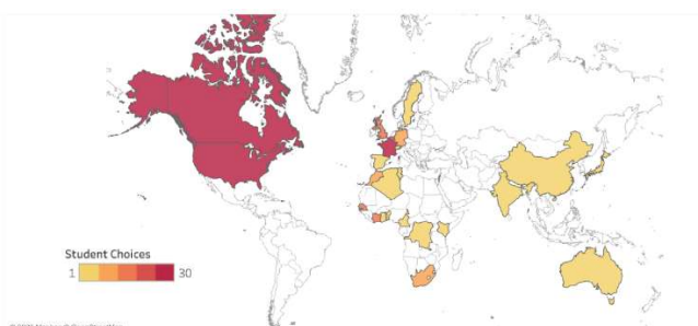
Figure 1. Preferred Destinations of Cameroonian and Congolese Senior Medical Students for Postgraduate Medical Training.

The most popular first choice specialties in our study were cardiology 14 (9.4%), pediatrics 14 (9.4%), and obstetrics and gynecology 13 (8.7%). 24.7% of women chose a surgical specialty, while 14.3% chose pediatrics as their first choice. On the other hand, 44.4% of men chose a surgical specialty, while 4.2% chose pediatrics as their first choice (Table 2).