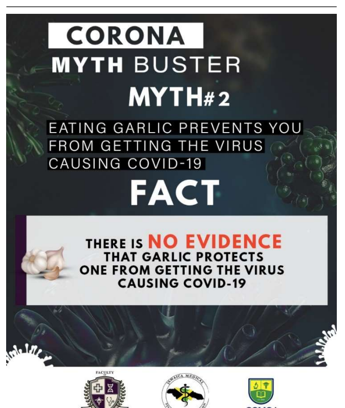
Figure 2. An example of a common myth that was debunked that was posted on our social media platform.

Although, I had the support of my team, it was undeniable that I felt overwhelmed at leading a project of such caliber. Will I be up to the task? Will I have the soft skills to manage the people under my leadership? Will we be able to make content that will replace the public's misconceptions? Although these doubts taunted me, I was still filled with pride that so many students and healthcare professionals were interested and willing to participate.