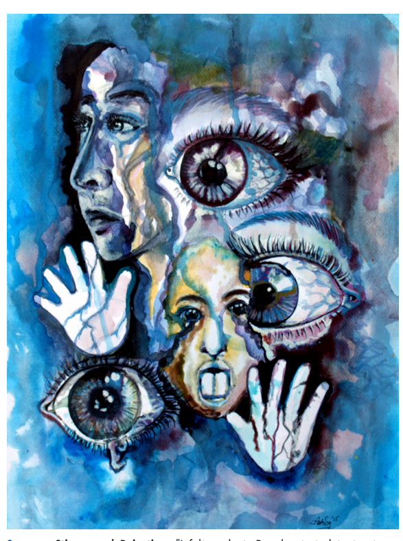
Scene 4. Stigma and Rejection. "I felt so lost. People started to treat me differently. They used to say hello but not anymore. Some of them looked away when they saw me. When they did look at me, it was with strange eyes. The feelings of sadness haunted me". — Pasung journey, Anto Sg, 1999. Cover of IIMS Volume 3 Issue 3.