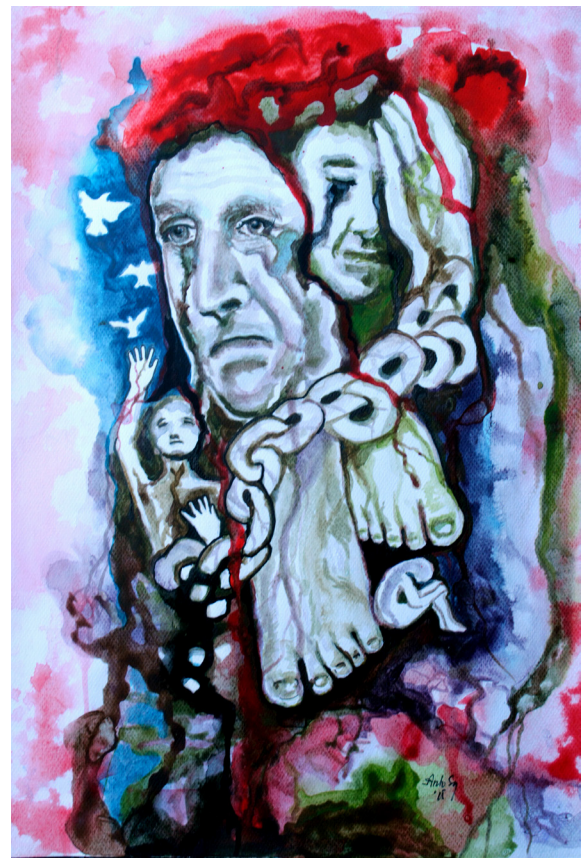
Scene 2. Pain in Shackles. "The true feelings of my pasung experience. It tortured my body and soul. I was in enormous pain and could barely breathe because of the burden in my heart. Pasung victims do really feel this. Freedom was so far away to be reached in my perspective at that point. I transposed these feelings into a painting. I was crying out but nobody cared. I felt hopeless". Cover of IJMS Volume 3 Issue 2.