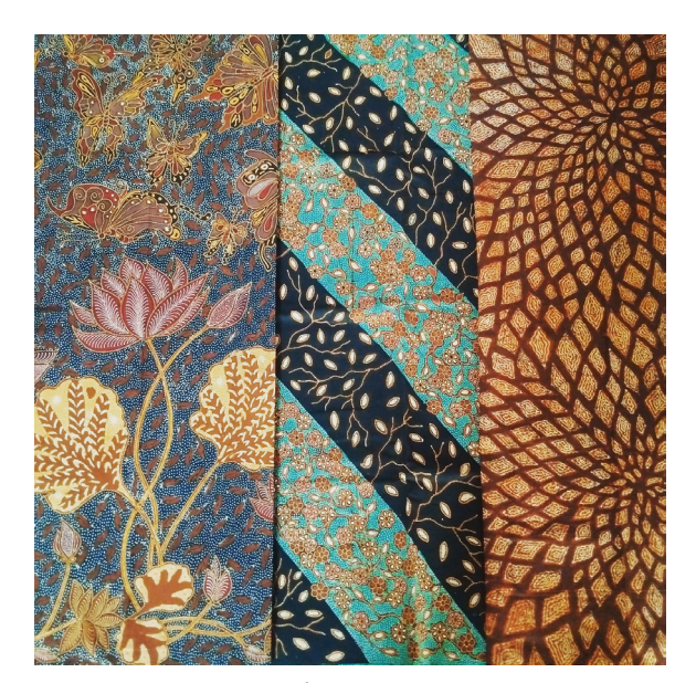
<u>Supplementary images:</u> Anto's paints. Not included in the covers.