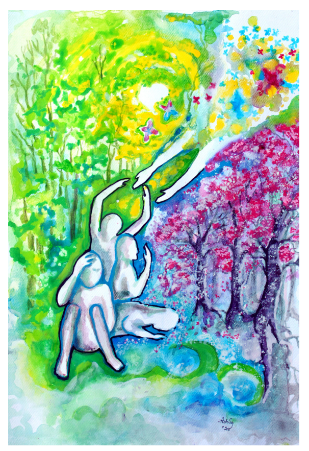
<u>Scene 5.</u> Embracing Hope and Life. "Finally, after a long struggle, I managed to find strength through self-motivation, introspections, and faith. I assembled pieces of my life back into a new form. New hope began. I survived again. My prayers are answered. Gratefulness is everything".