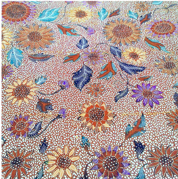
<u>Supplementary images:</u> Anto's paints. Not included in the covers.