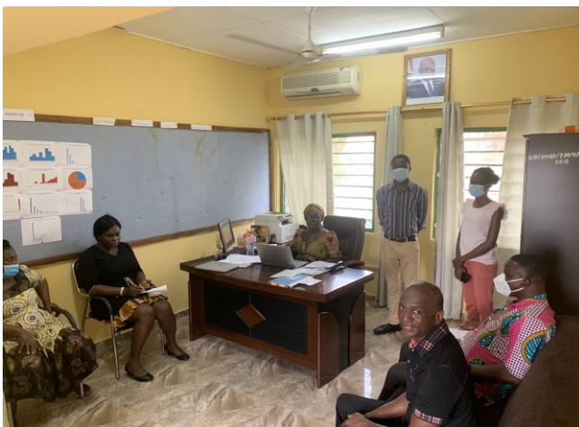
Figure 1. Meeting with the District Health Management Team at Tarkwa.

1 First-year House Officer. University of Ghana Medical School/Korle-bu Teaching Hospital, Ghana.