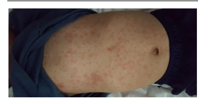
Figure 3. Morbilliform Rash on Patient's Ventral Trunk.

History and physical exam, including timeline of amoxicillin administration, lead to a clinical diagnosis of adverse reaction to penicillin. Management involved consideration for discontinuation of medications. Amoxicillin was stopped due to high suspicion as the causative agent of the rash. Further antibiotic treatment deemed unnecessary as resolution of AOM was noted per physical exam. With a low index of suspicion for CY as the underlying etiology of the rash, the decision to continue CY was made. CY outpatient therapy was maintained for management of the dermatologic symptoms, including itch while sustaining enhanced appetite stimulation and weight gain effect. Patient's parents were in agreement to therapeutic plan as they reported good compliance with CY, positive response in terms of improved weight gain and absence of pruritic symptoms. Weight at current encounter was a 1.95 kg increase from the time of CY initiation. Per discussion with patients at a subsequent unrelated encounter, rash continued for 2-3 days after discontinuing amoxicillin and cleared approximately a week later.