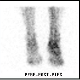
Legend: An anterior and posterior vision of a lower member bone scintigram evidence a moderate increase in arterial flow and diffuse hyperuptake in right foot and ankle. These findings correlated with the autonomic dysfunction in CRPS, leading to blood flow abnormalities

The patient began treatment with pregabalin and duloxetine in ascending doses until 75 mg every 12 hours and 60 mg per day, respectively. In addition, he received psychotherapy for pain management. Symptoms worsened after one year of treatment. Further therapeutics options were considered. The patient underwent 5 sympathetic blocks sessions, not being able to complete the 10 recommended sessions. Symptoms remained stable and the patient abandoned medical therapies in the third year. He explored alternative medicines such as acupuncture, phytotherapy, mindfulness, among others, without significant relief. Medical follow-up continued and during the fifth year of