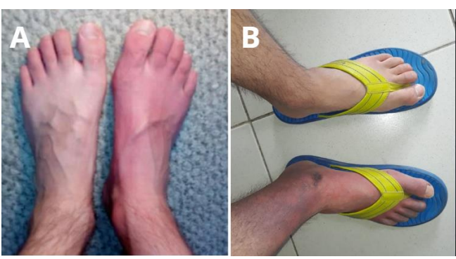
Legend: Physical examination at the third month (Figure 1.A): asymmetrical skin changes, with greater erythema in the right foot. Physical examination at the tenth month (Figure 1.B): increase of asymmetrical erythema, edema and hair loss in the right foot.

Due to pain persistence at the sixth month, the case study was complemented with vascular and rheumatological tests, which were negative. Additionally, it was performed a right ankle MRI, which reported the presence of calcaneal bone edema. Therefore, new kinesiotherapy sessions were indicated. At the tenth month, the symptoms worsened, increasing the affected area until middle leg Figure 1.B. Since symptoms could not be explained by the imaging findings, a lower member bone scintigram was requested Figure 2 . The exam reported a moderate increase in arterial flow and diffuse hyper uptake in right foot and ankle, confirming the diagnosis of a CRPS.