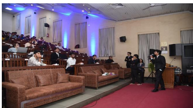
Figure 2. Photograph From In-Person Aegeus 2023.

To ensure the same, clinician's choice round was removed, MCQs were replaced by direct answers, each round was given an exciting name which was in line with a twisted rule for each round. Rapid fire round was also replaced by Buzzer Round to allow better scoring and tougher competition. As an objective replacement to the critical appraisal round, a round for identifying Biases in the given research summary was added. To eliminate any discrepancies or need of an expert judge opinion during the final round, process of validation by expert professor was done more stringently and questions were revised to make sure there is only a single best answer and no partially correct answer in any round.