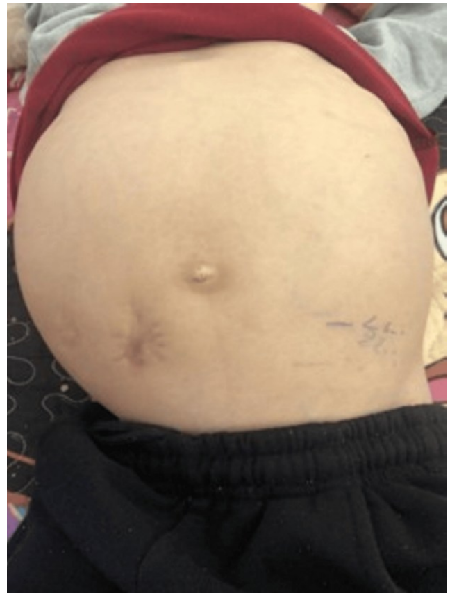
Figure 1. Clinical photograph showing the patient's abdomen after treatment.

This work is licensed under a Creative Commons Attribution 4.0 International License