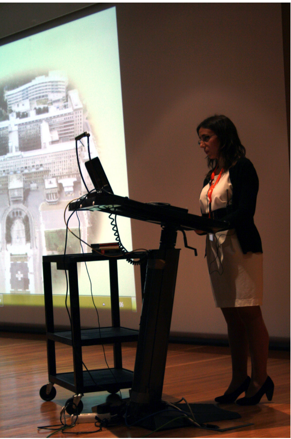
Figure 5. Orthopedic Trauma Workshop during the 4th AIMS Meeting