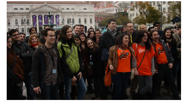
Figure 4. Lisbon on Foot; an opportunity to (re)visit Lisbon..

Last but not least, we would like to challenge you to make a difference and be part of networks like the AIMS Meeting and the IJMS, working together towards better medical education.