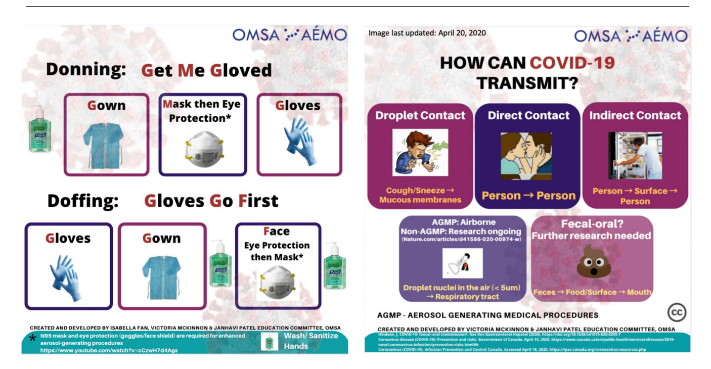
Figure 1. Infographics created with students of the Education Committee of the Ontario Medical Students Association