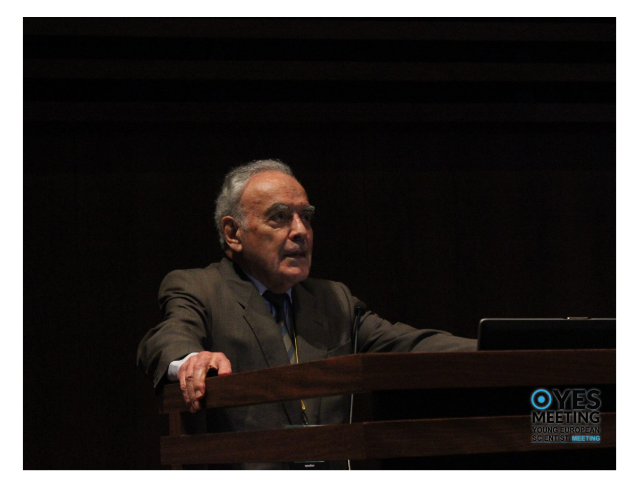
Figure 3. Photo from the YES Meeting, 2016.

The 11th YES Meeting Organizing Committee would like to thank all the participants for making it the most successful edition of the YES Meeting yet. The commitment to promote junior research on the biomedical field and to provide students with a platform to share their experiences will continue to be our major motivation for the 12th edition of our congress, that will take place from the 14th to the 17th of September 2017.