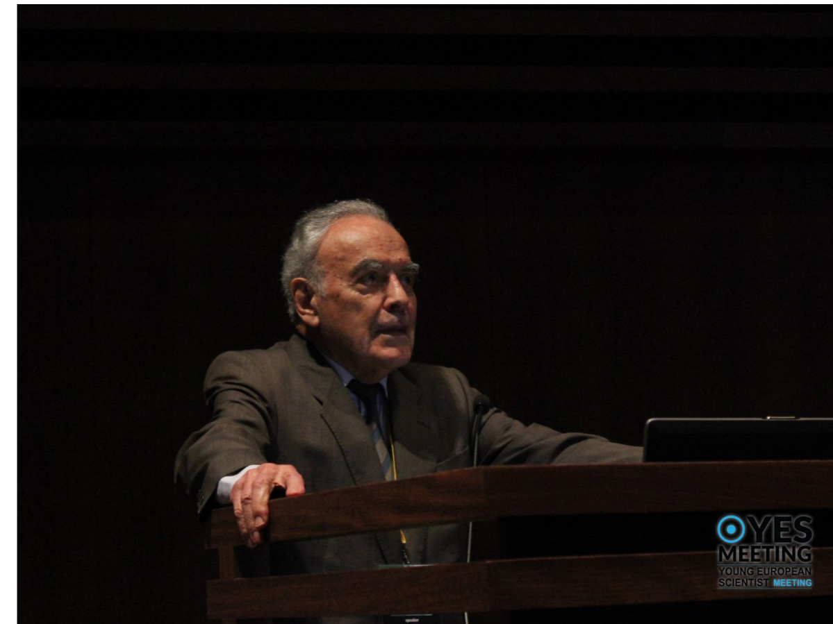
Figure 3. Photo from the YES Meeting, 2016.

The 11th YES Meeting Organizing Committee would like to thank all the participants for making it the most successful edition of the YES Meeting yet. The commitment to promote junior research on the biomedical field and to provide students with a platform to share their experiences will continue to be our major motivation for the 12th edition of our congress, that will take place from the 14th to the 17th of September 2017.