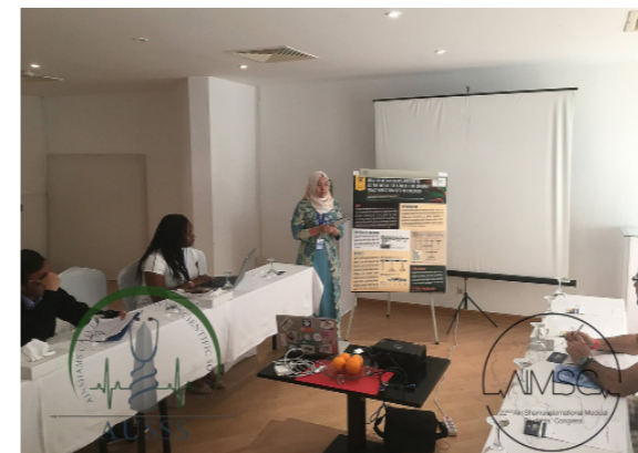
Figure 3. Title pending