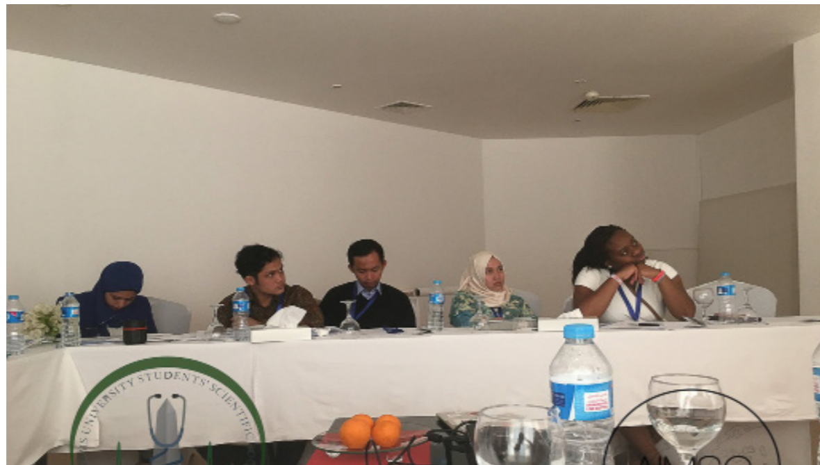
Figure 1. Title Pending.