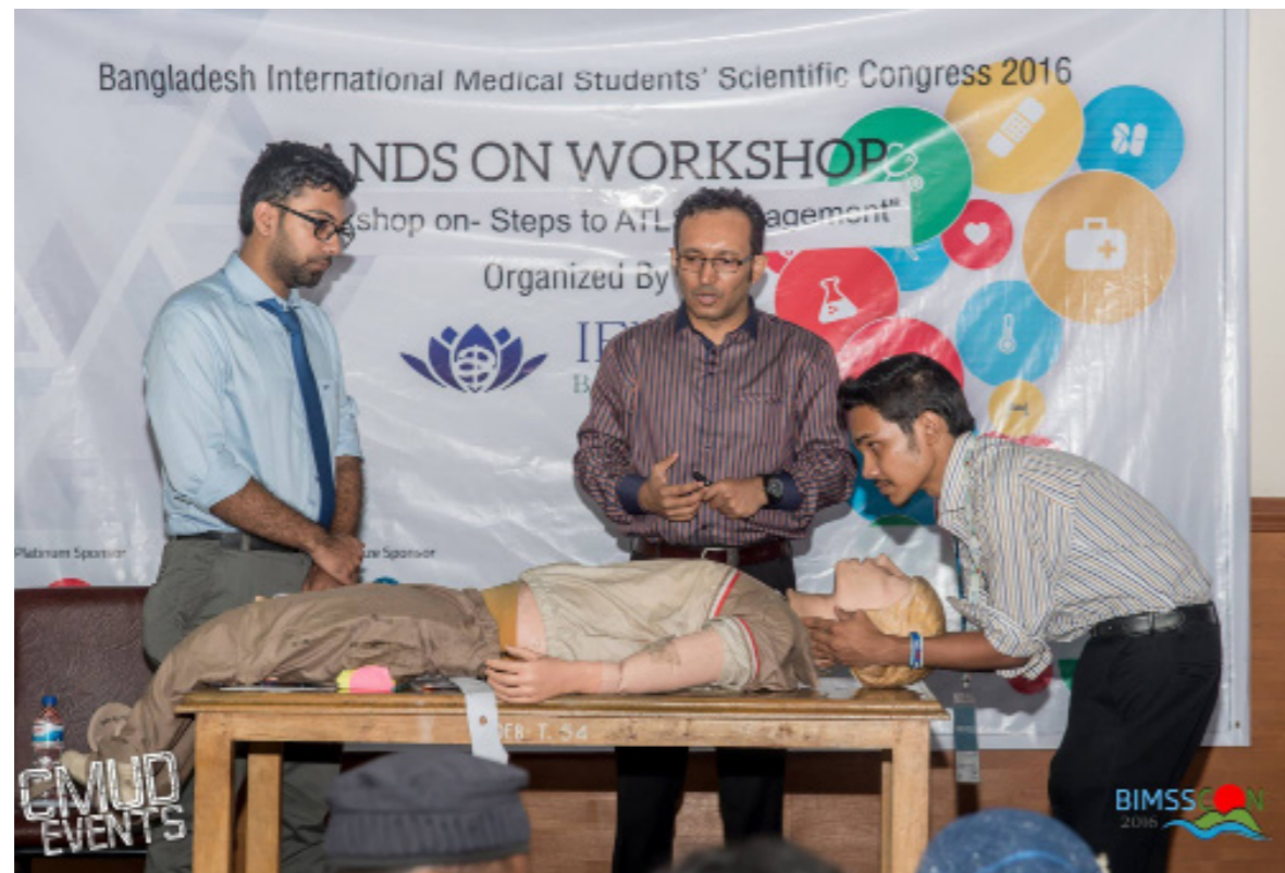
Figure 1. Photo from the BIMSSCON, 2016.