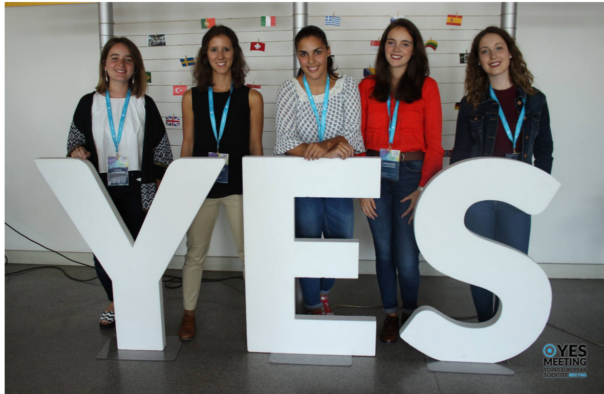
Figure 1. Photo from the YES Meeting, 2016.

Founded by a group of medical students and directed towards students, YES Meeting is driven by three major goals: to promote junior research on the biomedical field, to provide students with an experience sharing platform and to narrow the gap between world renowned researchers and the next generation of scientists. On its 11th edition, held from the 15th to the 18th of September 2016, more than 450 participants from 23 different nationalities had the opportunity to engage in an outstanding scientific program, present their own work, choose from over 40 challenging workshops and discover the city, through an exciting social program.