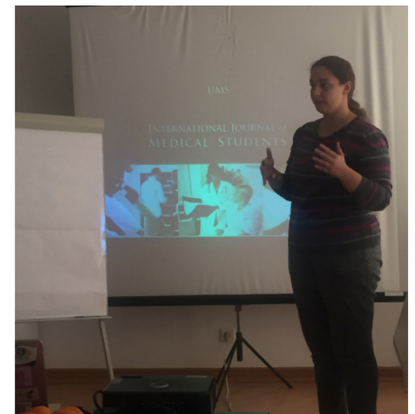
Figure 4. Title pending