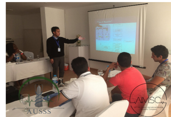
Figure 2. Title pending (example: Pictures taken during the 20th Academic Medical Congress of Piauí, COMAPI 2013, Piauí, Brazil.)

Name Address: (example: Campus Universitário Ministro Petrônio Portella - Bairro Ininga - Teresina - PI, Brazil.) Email: