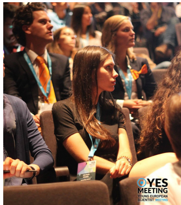
Figure 2. Photo from the YES Meeting, 2016.