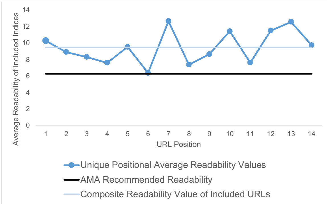
1 Figure 2: Grade-Level Readability Values for First 14 URLs in a Google Search for “pap smear” Compared to 2 Superimposed Static Lines Representing the Composite Average Readability of All URLs and the 3 Recommended Readability by the AMA.

4 5 6 7 8 9 10 11 12 13 14 15 16 17 18 19 20 21 22 23 24 25