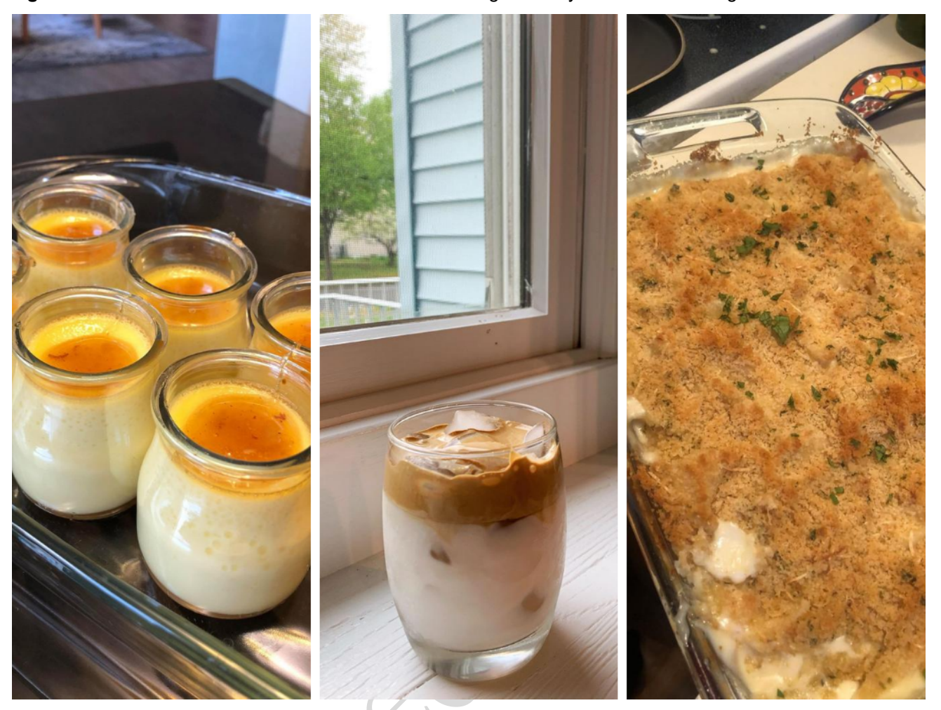
Figure 2. Photo Submissions from OUWB Students During the Daily Wellness Challenge

Legend: One of the daily wellness challenges was to try a new recipe.