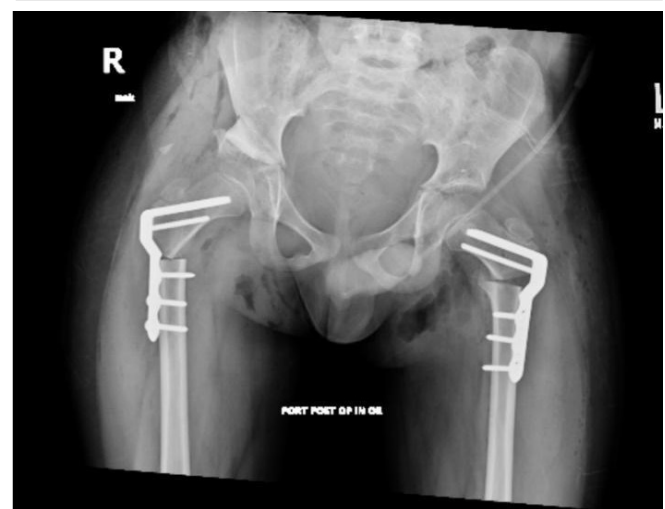
Figure 3. Immediate Postoperative X-Ray After Initial Hip Surgery. The Bones Have Been Spliced and Conjoined with LCP.

The patient tolerated the procedure and was admitted for a 6-week course of inpatient rehabilitation. His full weight-bearing status was tolerated immediately in postoperative conditions; after one year of the surgery, osteotomies were healed, and no complaints were reported with his ambulatory functional level maintained ( Figure 4 ). Due to his young age at the time of implantation, the initial plan was to remove the implants at one year postoperative. At the one-year postoperative clinic visit, the parents were unclear if there were any painful symptoms from the hardware prominence due to the child's limited communicative ability. According to the patient's mother, in retrospect, he had a vague thigh pain as he would point anteriorly or laterally to his thighs intermittently after more extended periods of walking and upright activities. The family proceeded with outpatient surgical hardware removal at 18-months postoperative with intraoperative findings marked with significant trochanteric bursitis bilaterally and symmetric bilateral loosening of shaft screws ( Figure 5 ). The child subsequently tolerated the hardware removal without any complications, returning to his previous functional level, pain-free.