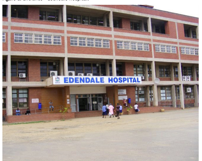
Figure 2. Entrance - Edendale Hospital.