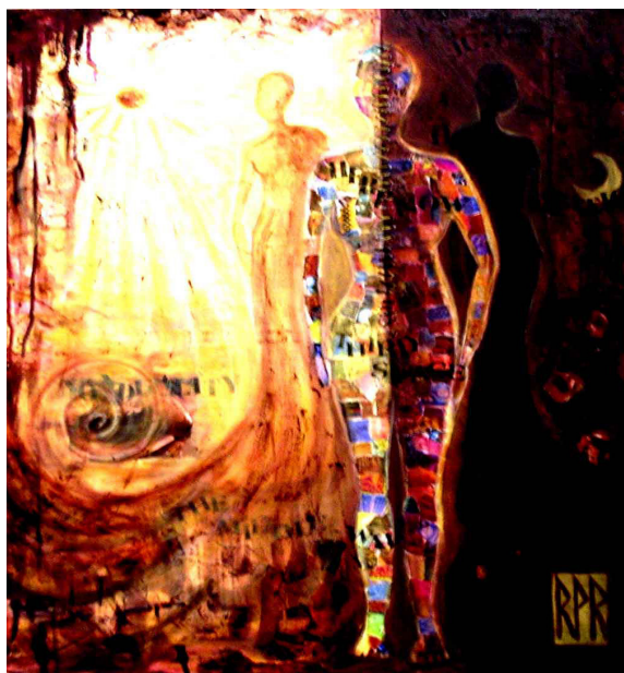
DSCN2308 Life Tapestries Collection

1. Available from: http://rprgallery.com/gallery/main.php , cited 2013 Sept 15.